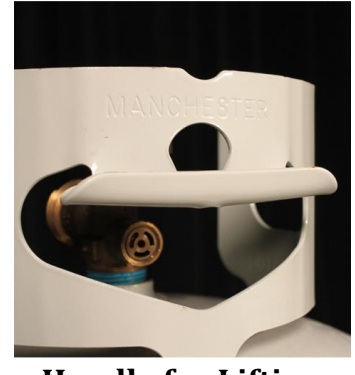
Handle for Lifting

Overfilling Prevention Device (OPD): As of April 1, 2002, cylinders without an OPD cannot be refilled. Beginning October 1, 1998, all newly manufactured small propane cylinders (capacity of 4- to 40-lbs. propane) were required to be equipped with an OPD. OPD equipped cylinders can be identified by either warning labels or the unique valve hand wheel, a modified triangular shape. The OPD marking is stamped into the wheel and valve body itself. Page 10 of 24