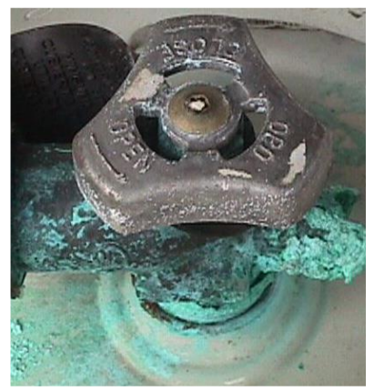
Anhydrous Ammonia Stain