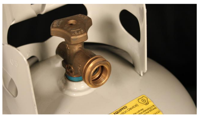
Service End of Cylinder

Portable and exchange cylinders will rarely have more than one fitting that is threaded to a <sup>3</sup>/<sub>4</sub>" female National Pipe Thread (NPT) fitting and raised above the surface. As a result, the fitting is often called the neck of the cylinder. A combination service valve and pressure relief valve is installed in the fitting.