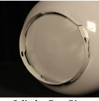
Cylinder Foot Ring

Cylinder foot ring : Every aluminum or steel cylinder has a foot ring. The foot ring is a wide metal band that is welded or brazed to the bottom (non-service end) of the cylinder. It is used to protect the bottom of the cylinder body from corrosion or other damage and also functions as a support stand or base.