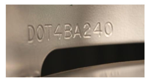
Specification Design Code

Cylinder specification markings consist of two basic parts: the design code and the service pressure. DOT-4BA240 is one of several specifications for cylinders. The term "4BA" indicates that the cylinder is a welded (series 4) alloy steel (series BA) cylinder. The number "240" indicates the service pressure is 240 pounds per square inch gauge (psig).